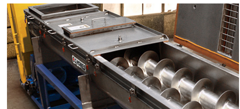
Thermal Screw Conveyors provide efficient heat transfer while conveying bulk materials through heating, cooling, or drying stages.

Figure 1 shows a processing system illustrating CPEG's single-source approach to complete plant solutions. The image highlights how Carrier Vibrating Equipment, Heyl Patterson Thermal Processing, Buflovak, Sly Air Pollution Control, PK Blenders, and S. Howes technologies are combined into a unified process line covering material handling, thermal processing, mixing, and emissions control to optimize efficiency, consistency, and overall plant performance.