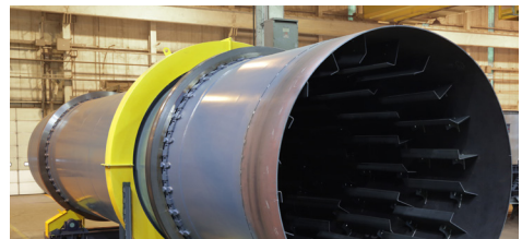
Rotary dryers provide reliable, high-capacity moisture reduction for raw materials, additives, and byproducts used in cement production.