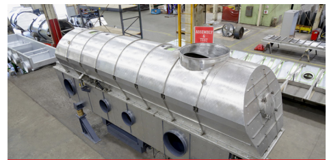
Vibrating Fluid Bed systems provide uniform cooling and drying when processing cement materials

Drying and thermal processing stages account for a substantial portion of a cement plant's energy consumption. As fuel prices rise and environmental regulations tighten, inefficient thermal systems become a significant liability. Legacy equipment often lacks modern heat recovery, insulation, and control capabilities, leading to excessive fuel use and unnecessary greenhouse gas emissions.